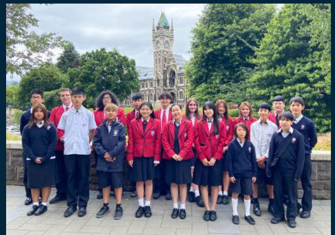
Early in the term our international students attended a mayoral welcome at the University of Otago.

(Note: Equity Band is the new term for schools with similar student demographics. We still compare ourselves with "like" schools, just as we have done in the past when comparing our results to those of other decile 8-10 schools.)