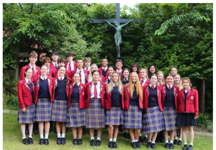
The 2024 Trinity Catholic College Prefects

Teachers and students alike are truly enjoying the benefits of the new, immensely improved facilities and it will be wonderful to have all staff involved in the visual and performing arts located together in the same building.