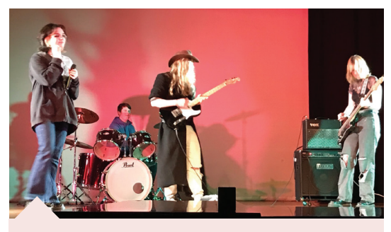
Bridger Street plays at Kavanagh's Got Talent.